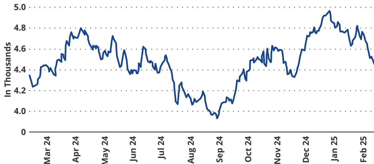
Exhibit 2 – Treasuries Strong YTD