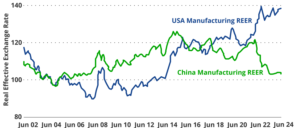
Exhibit 3 – China’s Low Inflation Has Led to Cheaper Real Effective Exchange Rates (REER) vs. USD